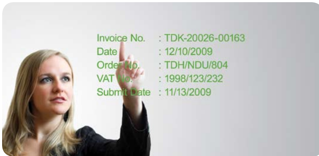
Touch screen capture, classification and indexing with ABBYY TouchTo Technology and Fujitsu fi-6010N scanners